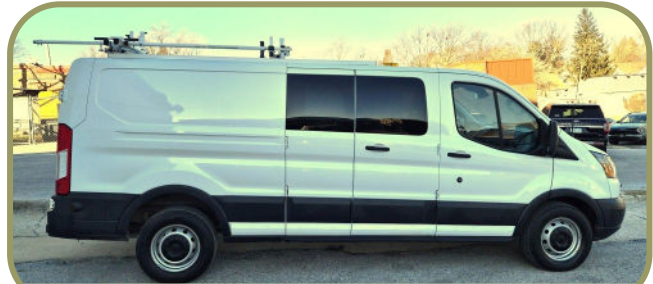
Our "new to us" 2018 Ford Transit Van !! See details on the back page.

PO Box 69 Phone: 712.235.7226 Harlan, IA 51537 Web: www.scco-inc.org